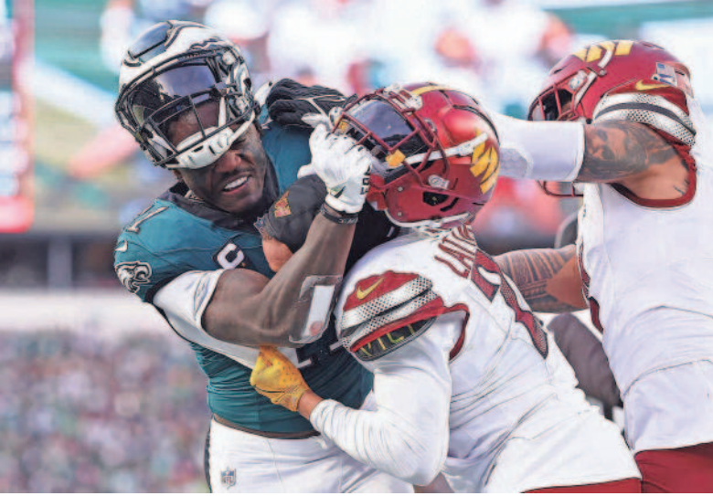
Eagles wide receiver A.J. Brown gets into a fight with Commanders cornerback Marshon Lattimore during the first half Sunday.

Equally destructive were a pair of personal-foul penalties at the end of the first half, as the Eagles extended their lead from 14-12 to 27-12 in 65 seconds between the two-minute warning and halftime.