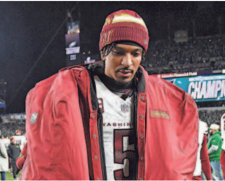
Commanders quarterback Jayden Daniels walks off Sunday after their season ended.

The motivation of knowing what it feels like to lose the NFC title game has